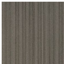
Seam 64761 LRV 8.9