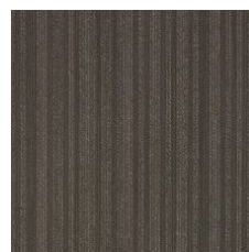
Boundary 64752 LRV 5